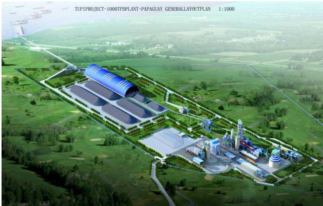
Fig. 3: Planned final layout of the cement plant