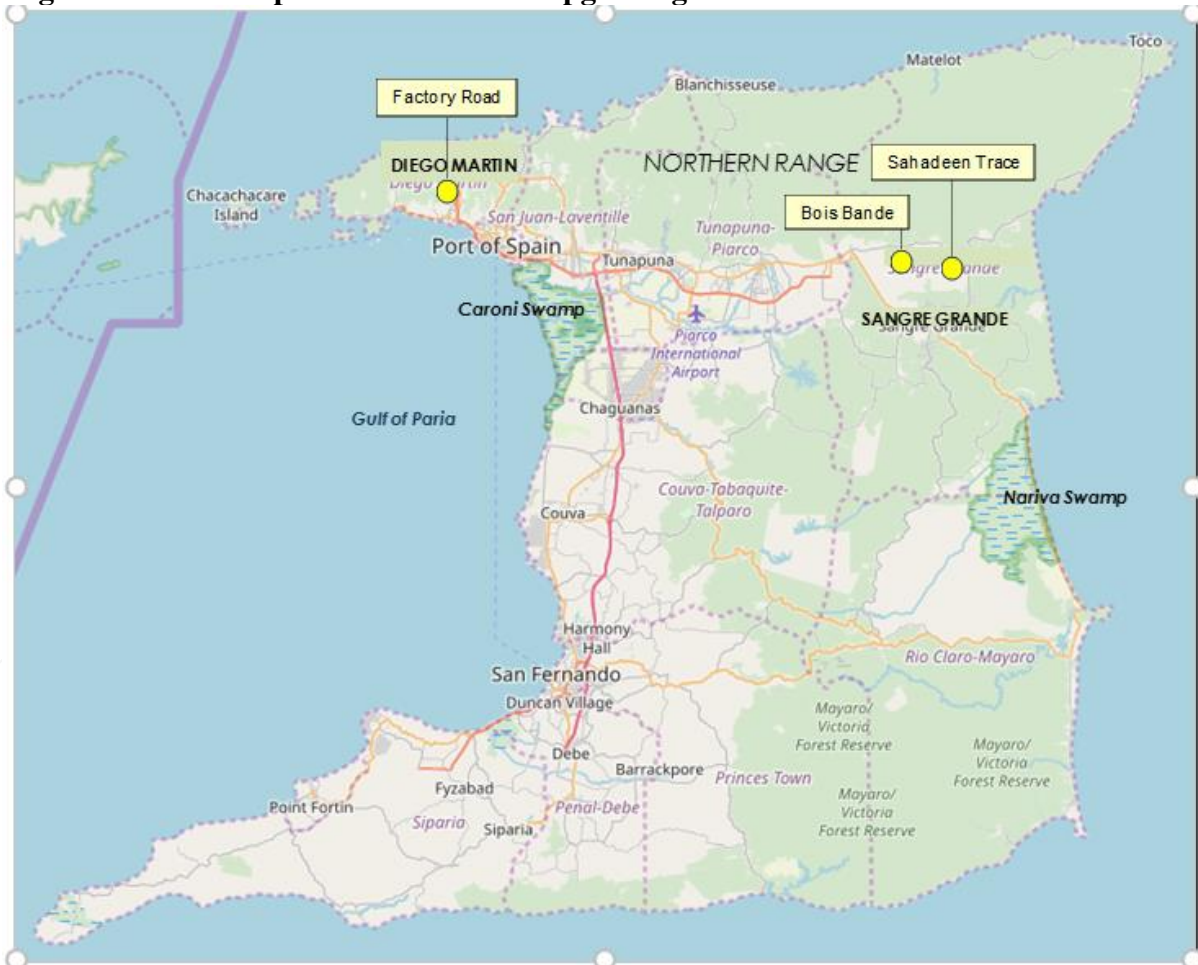
Figure 1 : The Sample Sites for Urban Upgrading

Ilesi Consultants Limited prepared an Environmental and Social Assessment (ESA), and this ESMP serves as an action document arising from that ESA. The aim is to guide all parties involved in the proposed works, so that they fully understand the environmental and social mitigation measures, as well as the monitoring which must be done. The objective is to ensure that mitigation and monitoring are undertaken in a timely fashion.