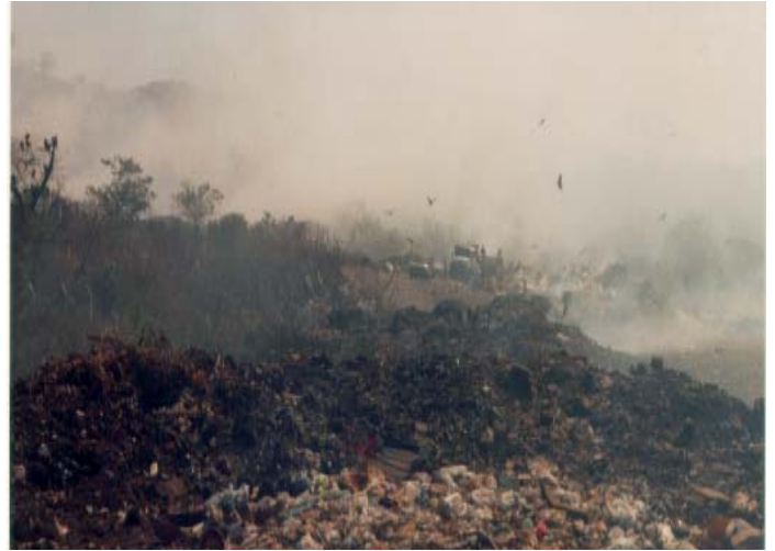
San Miguel dump