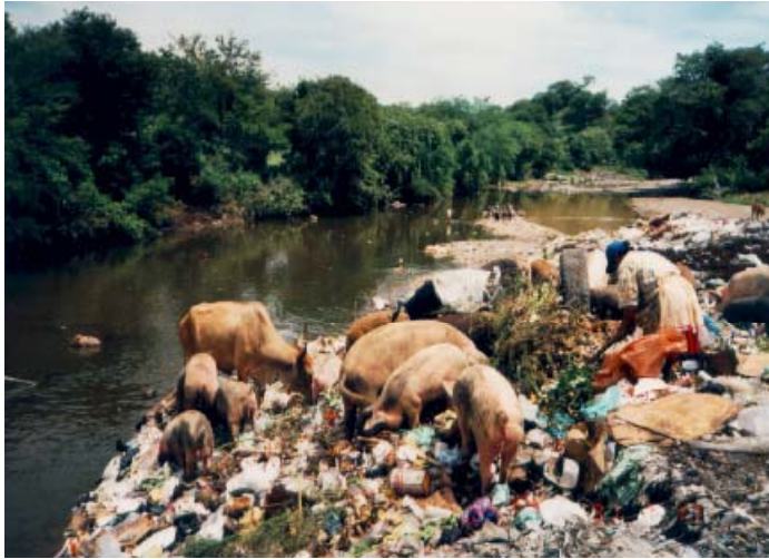
Santa Rosa de Lima dump