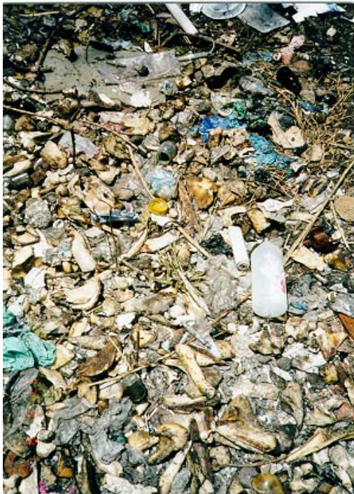
Hospital waste on hospital premises (San Miguel)