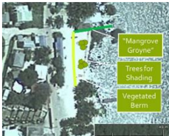
Figure 2- Proposed Coastal Protection Works in Caye Caulker