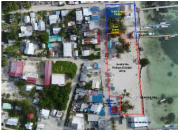
Figure 5- LRP Analysis of the legal status of the project's area