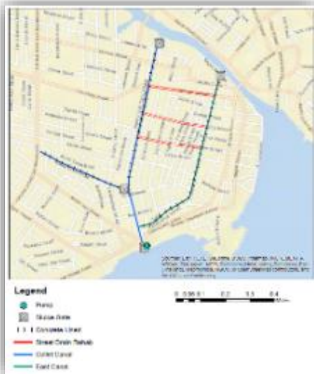
Figure 1- Proposed Flood Control Works in Belize City

Additionally, there are two Technical Cooperation (BL-T1090 and DF-BL-T1098) including additional studies to support the implementation and monitoring tools for the design of BL-L1028.