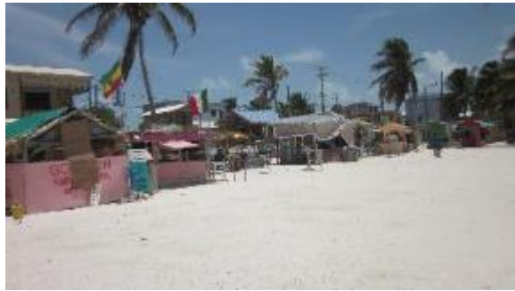
Figure 4- View of the current artisans and vendors at the Palapa Gardens