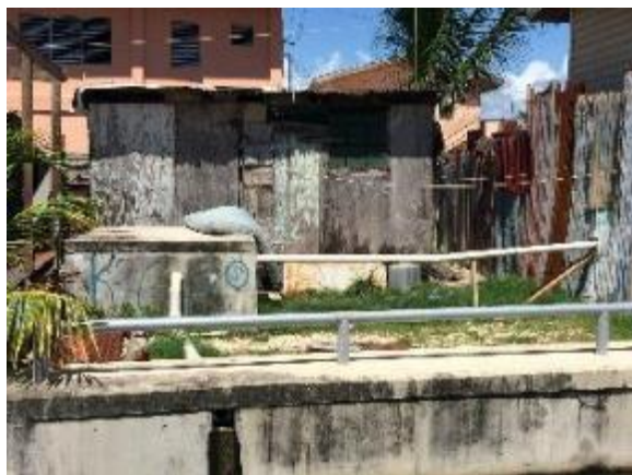
Figure 3- Illegal sewerage systems

i) Belize City: Due to construction, there is a risk of permanent displacement of the sewerage systems of 10 households (25 residents) in the Conch Shell Bay area and 12 households (approximately 66 residents) in North Creek Alley. All of them are vulnerable households illegally discharging sewerage effluent into the canal. Two piers used by the fisherfolks and 6 fisherfolks might be also affected. For all of them, the LRP presents different relocation, rehabilitation or compensation alternatives that will be put in place by the borrower to address potential risks on physical displacement, economic displacement and economic losses. In addition, during construction dredging activities will generate relevant quantities (1200 truckloads) of sediments to be disposed of properly since could be partially contaminated. To this regard, the ESA includes a specific dredging and sediments management plan that will have to be ready and finalized by the Borrower before construction. Contaminated sediments will have to be treated, neutralized, and disposed in authorized site in line with IDB policies.